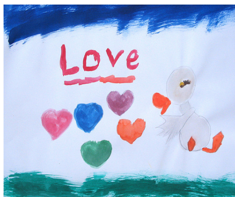
Art on Purpose's Baltimore Inspired by Poe workshop