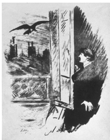
Édouard Manet. Open Here I Flung the Shutter (The Window) . 1875

For information and to register, call 845-563-3646.